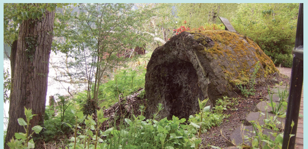
Crucible from the Oregon Iron and Steel Company, Lake Oswego, Oregon, May 2009.

well as some other expenses. Volunteers should consult their tax advisor or refer to IRS Publication 526, Charitable Contributions.