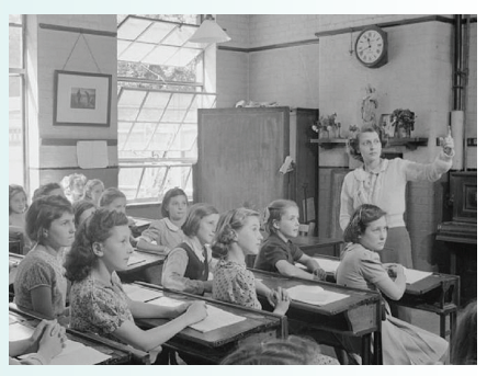
Geography lesson, St. Joseph's Elementary School, Upper Norwood, UK, 1945.

There is a Sunday morning workshop —Maps! Wonderful Maps!—that will cover traditional and online resources of maps, reading, interpreting, correlating map information with other documentation, problem solving, and hands-on work.