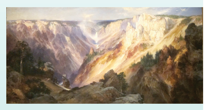
Grand Canyon of the Yellowstone by Thomas Moran, 1904.