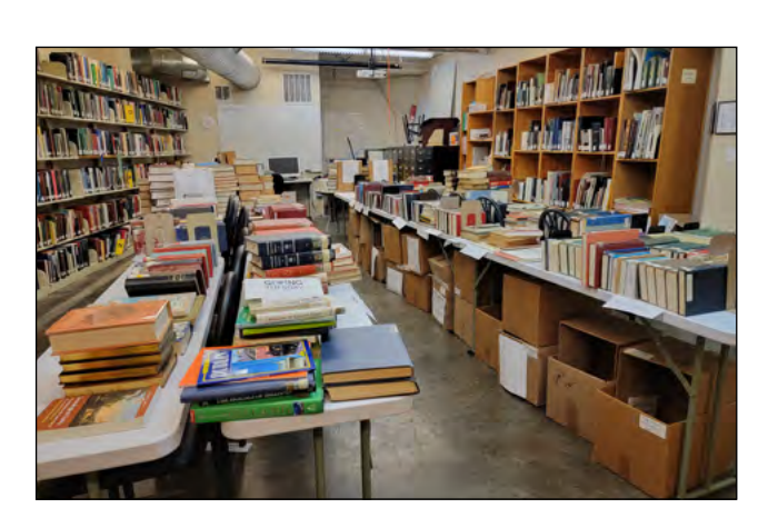
On GivingTuesday, GFO offered 1,100 books sorted by state and topic to local societies.

We extended GivingTuesday into the following week, added even more books, and opened the