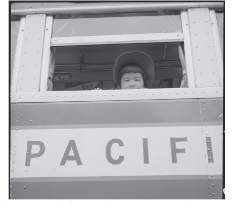
A young child on the evacuation bus set for Tanforan Assembly Center.

Densho, according to the website, means to "leave a legacy" in Japanese. In addition to the genealogy series, the project has amassed a considerable legacy on the incarcerations and other aspects of Japanese American life. Perhaps most fascinating are the hundreds of oral histories on topics such as life in Japan, reasons for leaving, picture brides, community activities, and more. The oral histories can be browsed by narrator, topic, facility, or collection, or searched using specific keywords. There are also digital archives with photographs,