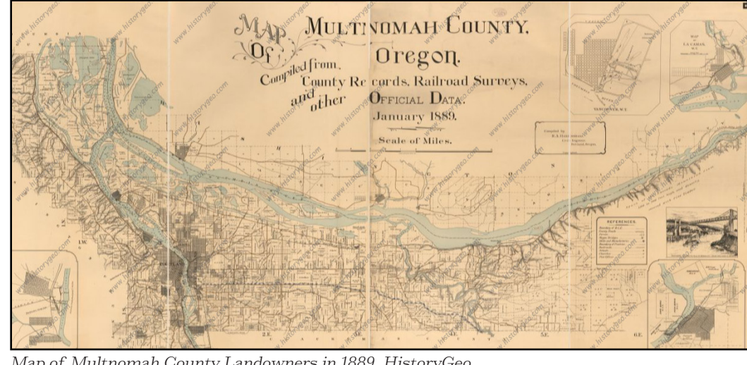
Map of Multnomah County Landowners in 1889. HistoryGeo.